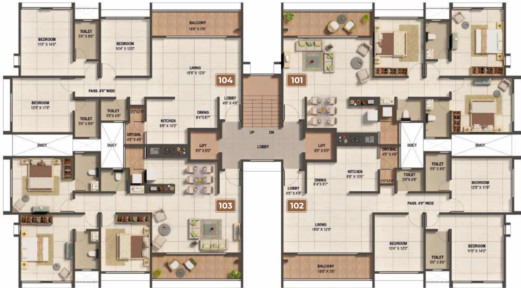
Floor plan 1st to 6th typical floor