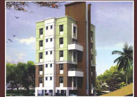
SAI SHRIYA PARK Dhayri