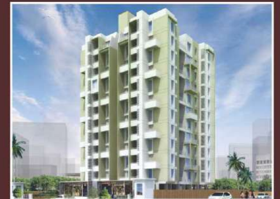
THE ORCHID Wagholi