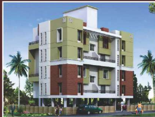
NATURE COURT Undri