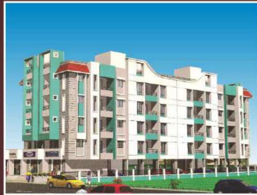
SAI SHRIYA RESIDENCY Dhayri

..... Brings you 1 and 2 BHK homes nestled in picturesque surrounding of Vadgaon Sheri. Pristine Nature, Ample breeze and sunlight greet you at the SOUL. Apart from these natural luxuries, Soul offers needful amenities and thoughtfully designed specifications offer a bliss of modern, luxurious lifestyle. Get the best & Look forward to a home with spiritual touch at SOUL.